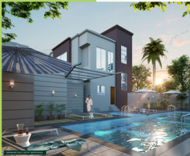
Modern Pool Party Apartment