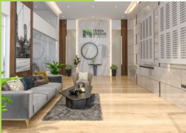
Delivered with all the amenities