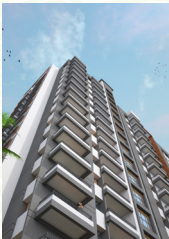
DYNAMIC VIEW | ARTIST IMPRESSION