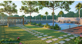
Pool Party Apartment